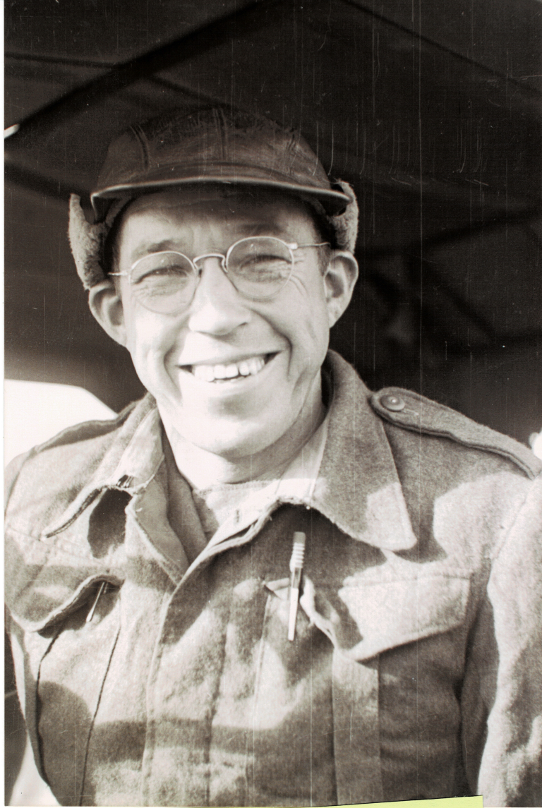
• CHAMPION ↓