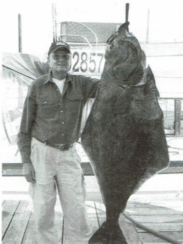
This is my 100 pound Halibut. My biggest fish. Does older mean better?