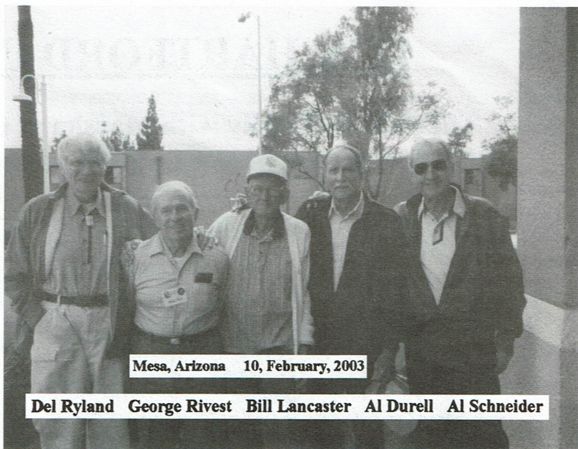
Mesa, Arizona 10, February, 2003